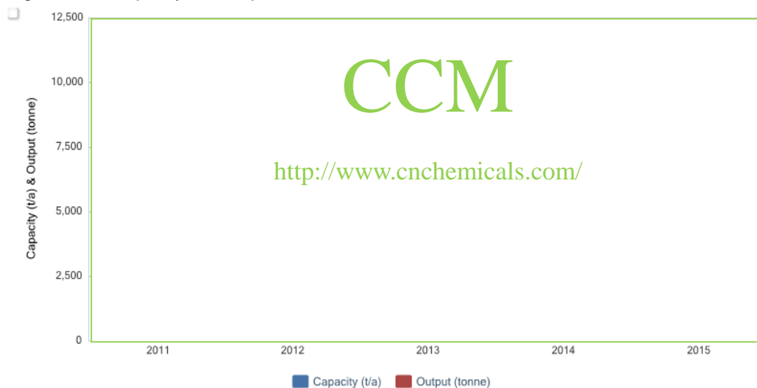
Figure 2.1-1 Capacity and output of clethodim 90% technical in China, 2011-2015